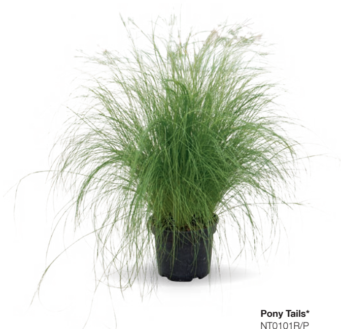
Pony Tails* NT0101R/P