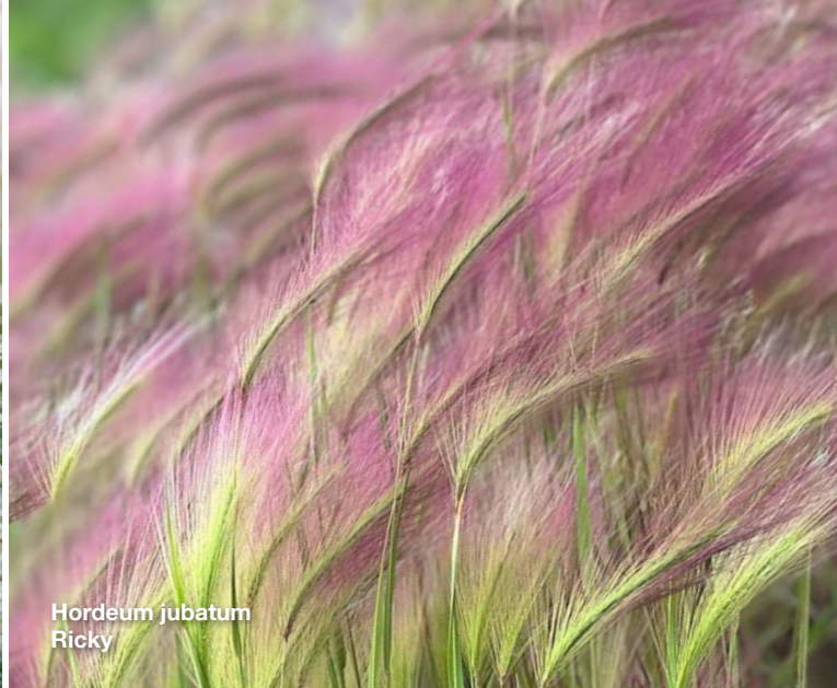
Hordeum jubatum Ricky