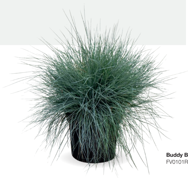
Buddy Blue FV0101R